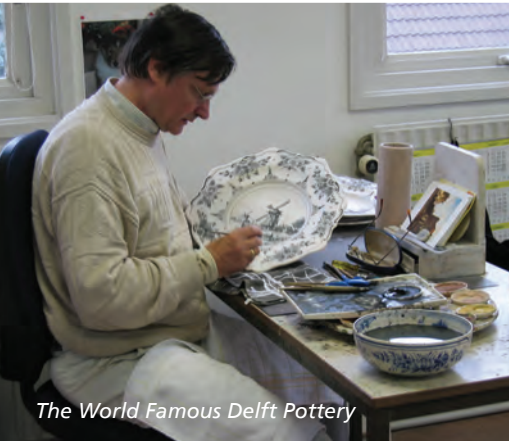
The World Famous Delft Pottery