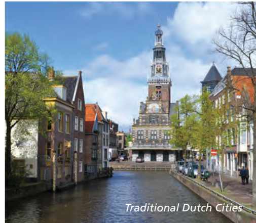
Traditional Dutch Cities