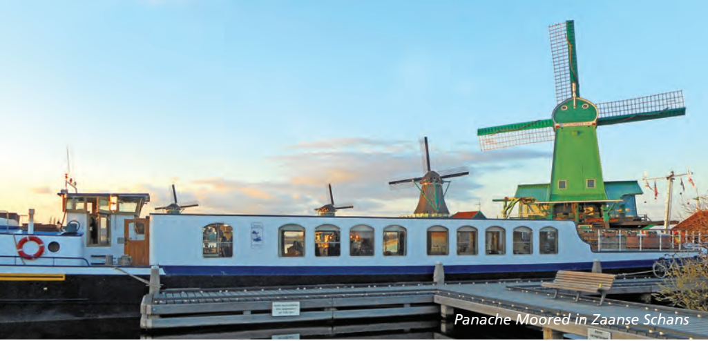
Panache Moored in Zaanse Schans

*This is a sample itinerary for Panache and is subject to change. On alternate weeks the cruise is in the reverse direction.