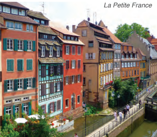
La Petite France