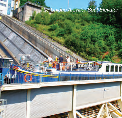
The Unique Arzwiller Boat Elevator