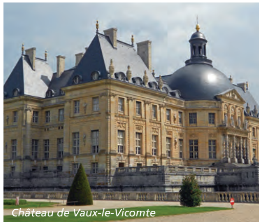
Château de Vaux-le-Vicomte