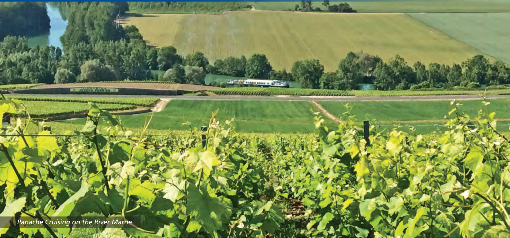
Panache Cruising on the River Marne