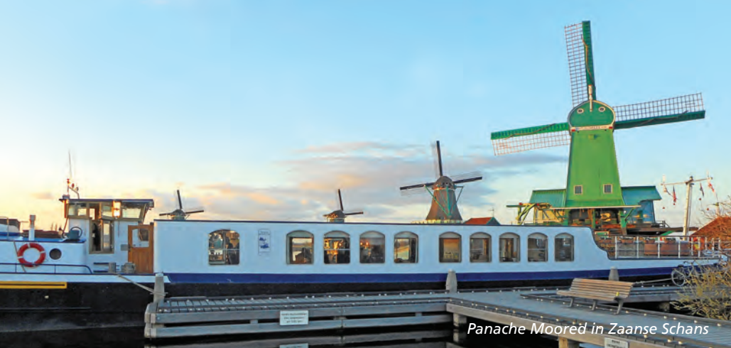
Panache Moored in Zaanse Schans

*This is a sample itinerary for Panache and is subject to change. On alternate weeks the cruise is in the reverse direction.