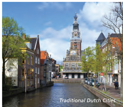
Traditional Dutch Cities