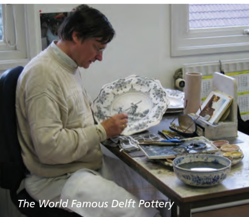
The World Famous Delft Pottery