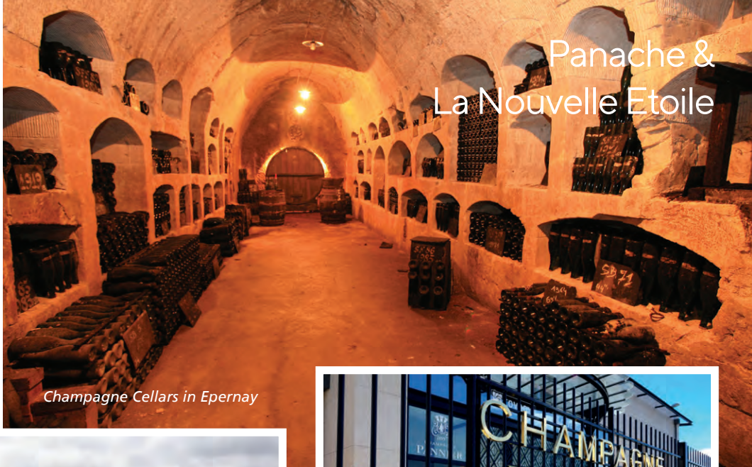
Champagne Cellars in Epernay