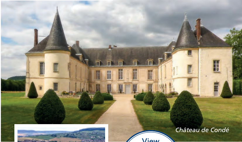
Château de Condé