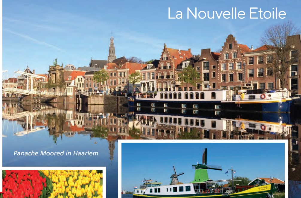
Panache Moored in Haarlem