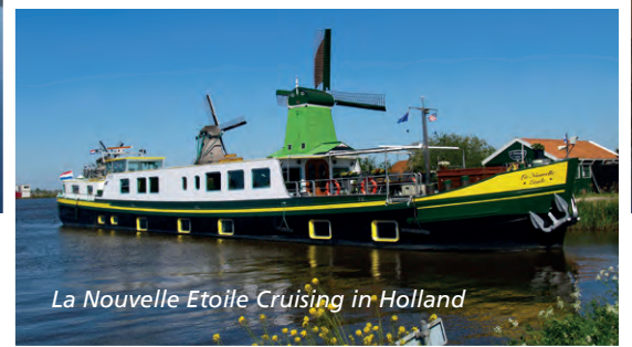
La Nouvelle Etoile Cruising in Holland