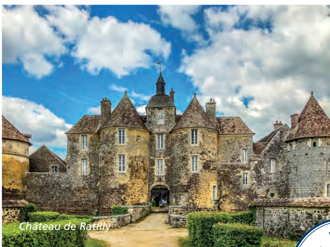
Château de Ratilly