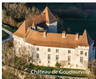
Château de Goudourville