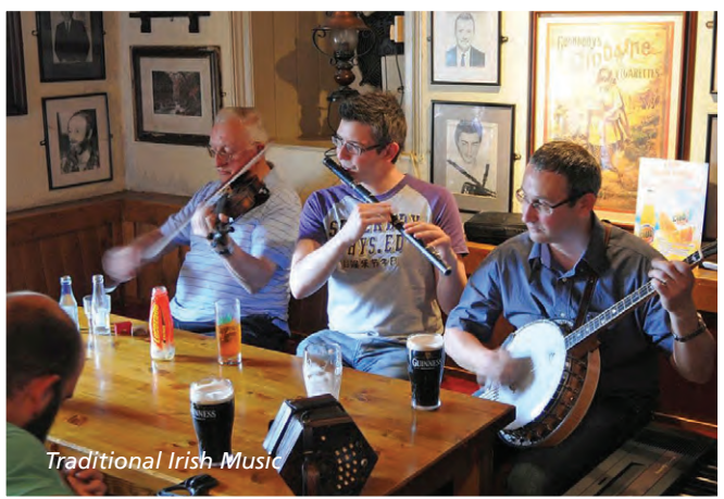
Traditional Irish Music