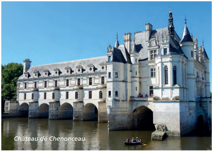
Château de Chenonceau