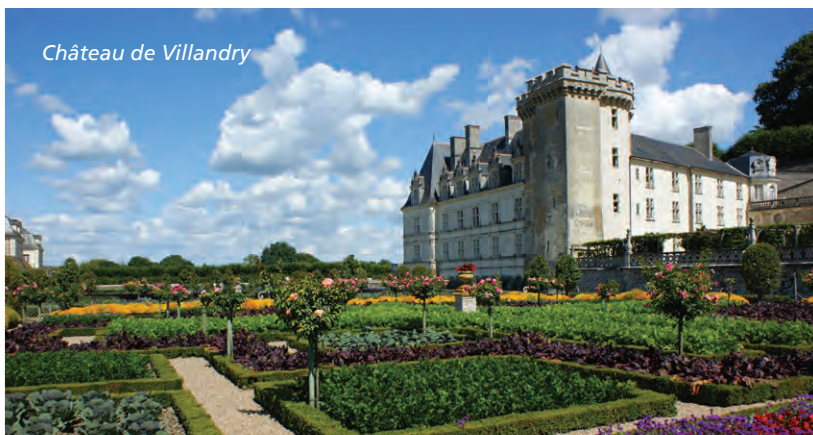
Château de Villandry