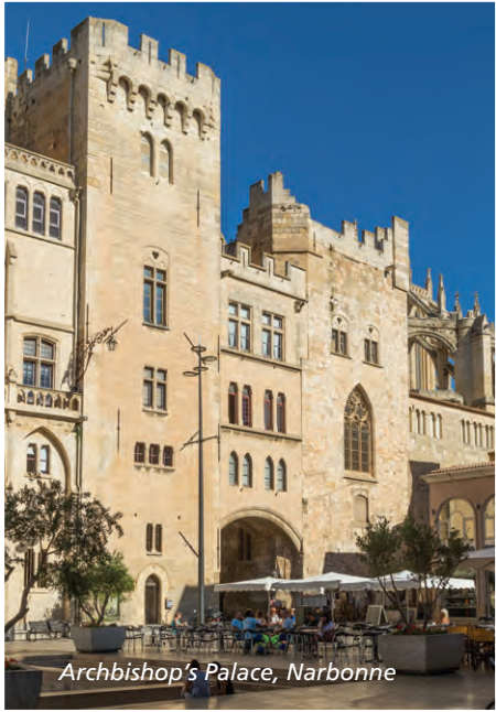
Archbishop's Palace, Narbonne