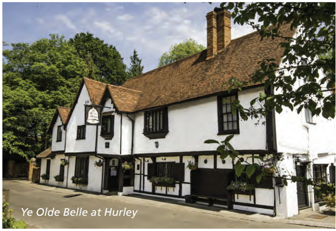
Ye Olde Belle at Hurley