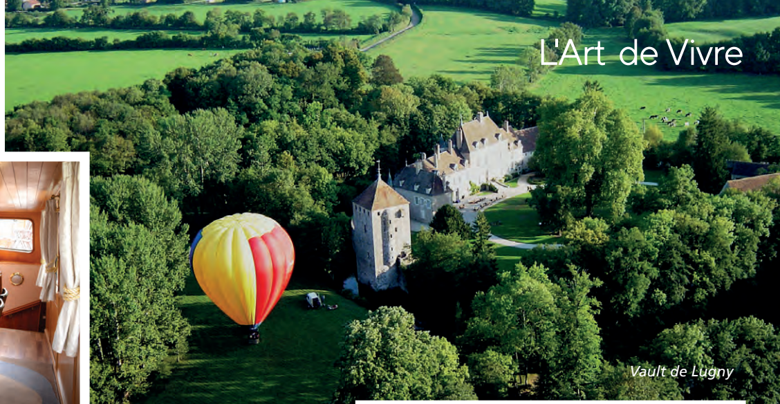
Vault de Lugny