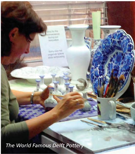
The World Famous Delft Pottery