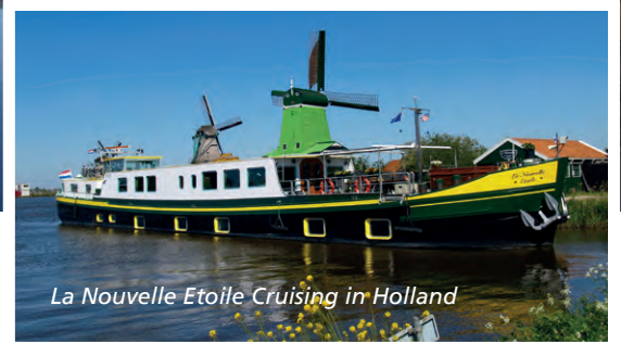
La Nouvelle Etoile Cruising in Holland