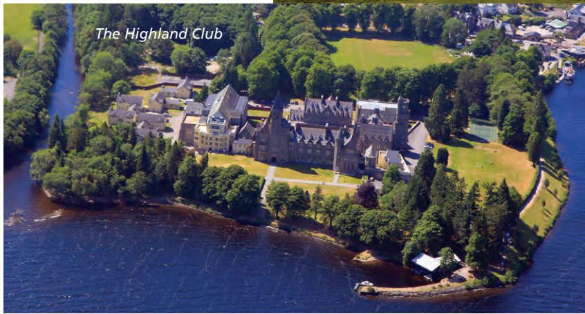
The Highland Club