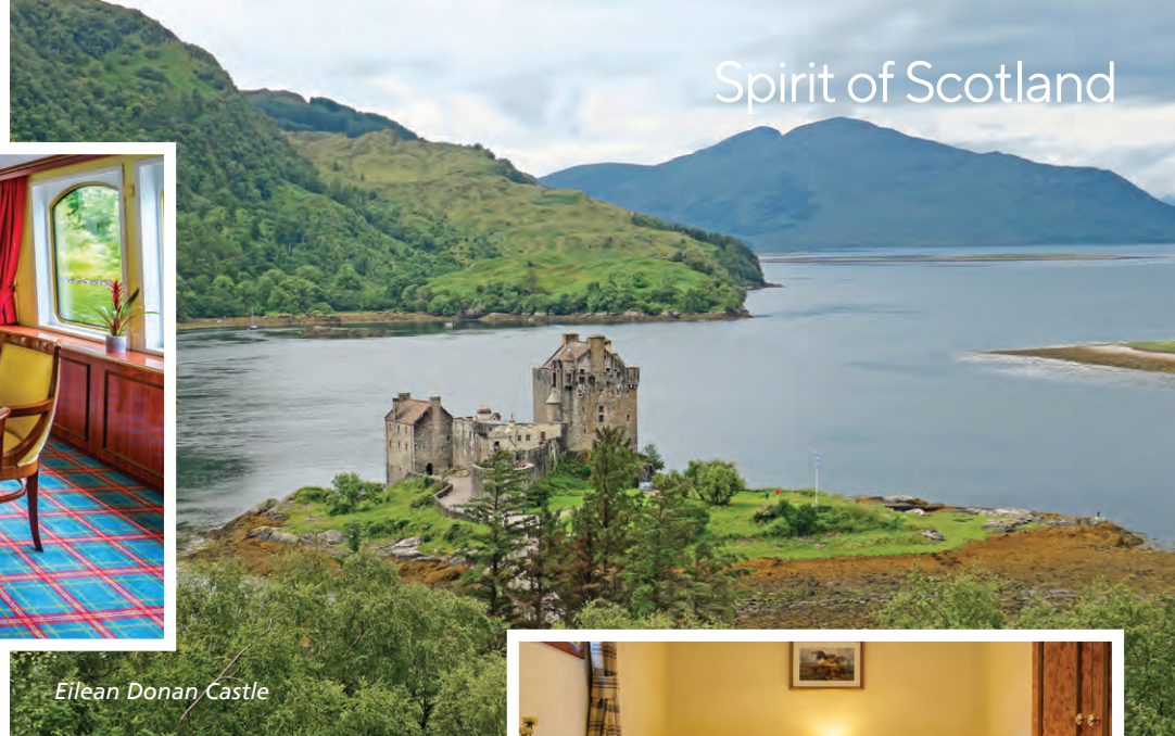
Eilean Donan Castle