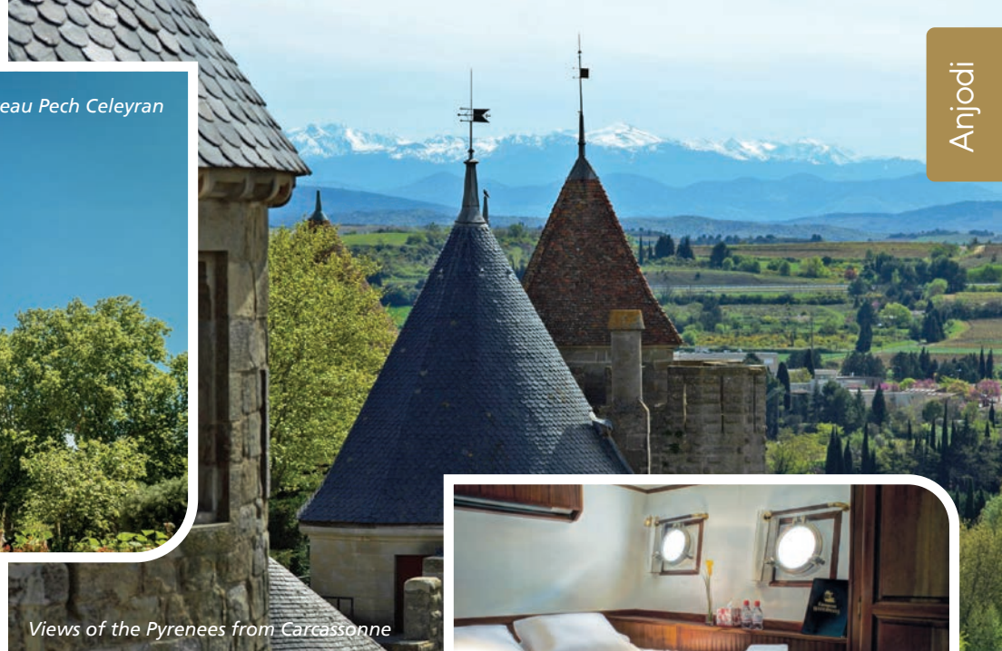
Views of the Pyrenees from Carcassonne