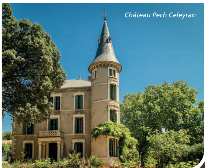
Château Pech Celeyran