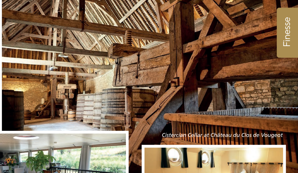
Cistercian Cellar at Château du Clos de Vougeot