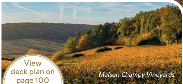
Maison Champy Vineyards