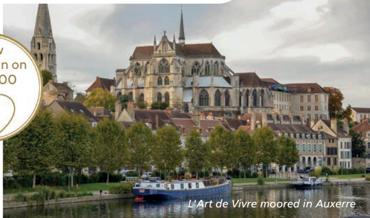
L'Art de Vivre moored in Auxerre