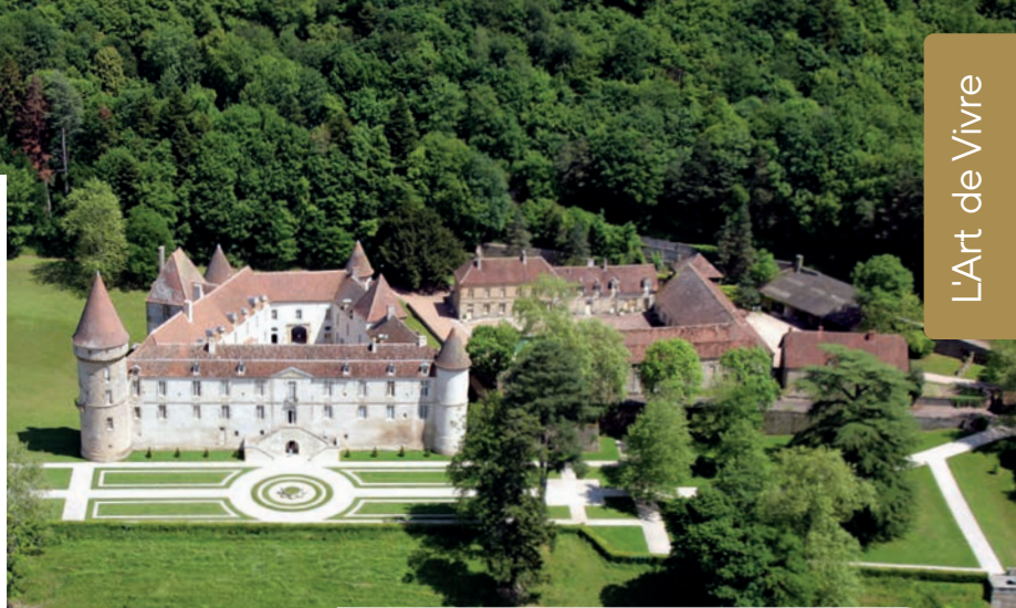
Château de Bazoches