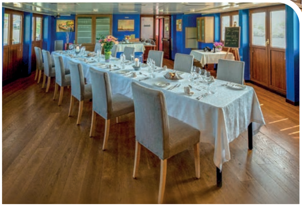
Villa Ca Zen