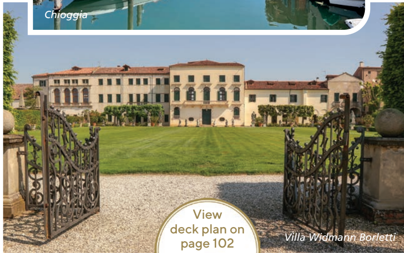
Villa Widmann Borletti