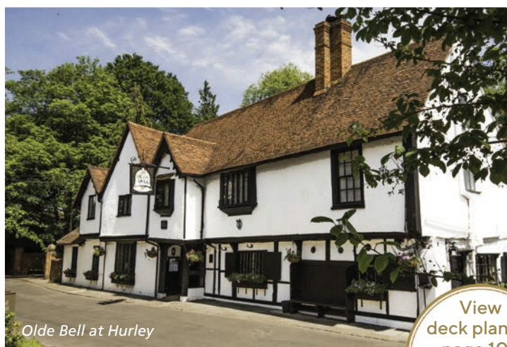
Olde Bell at Hurley