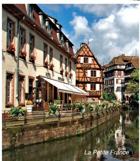
La Petite France