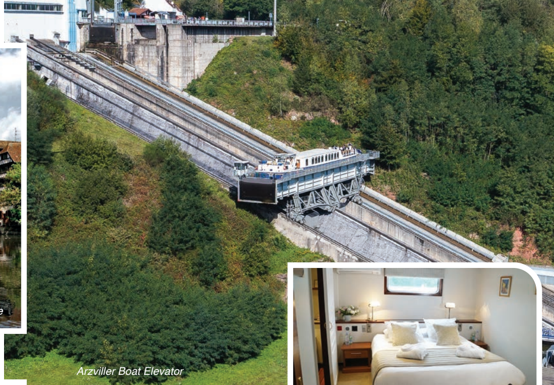
Arzwiller Boat Elevator