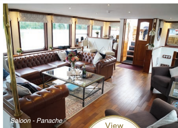
Saloon - Panache