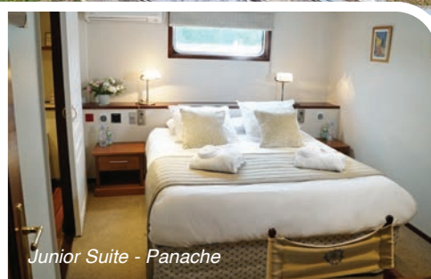
Junior Suite - Panache