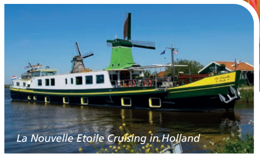
La Nouvelle Etoile Cruising in Holland