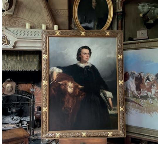
Studio Home of Rosa Bonheur