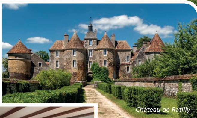
Château de Ratilly