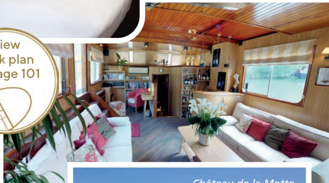
Château de la Motte