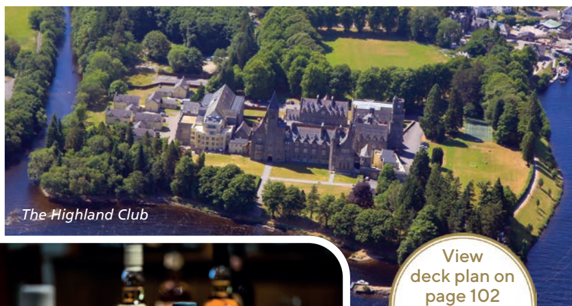
The Highland Club