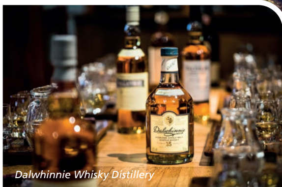
Dalwhinnie Whisky Distillery